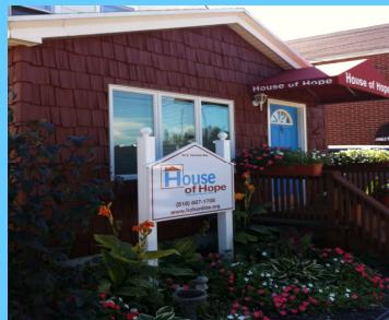
Home of the House of Hope Transforming communities ~ one life at a time.